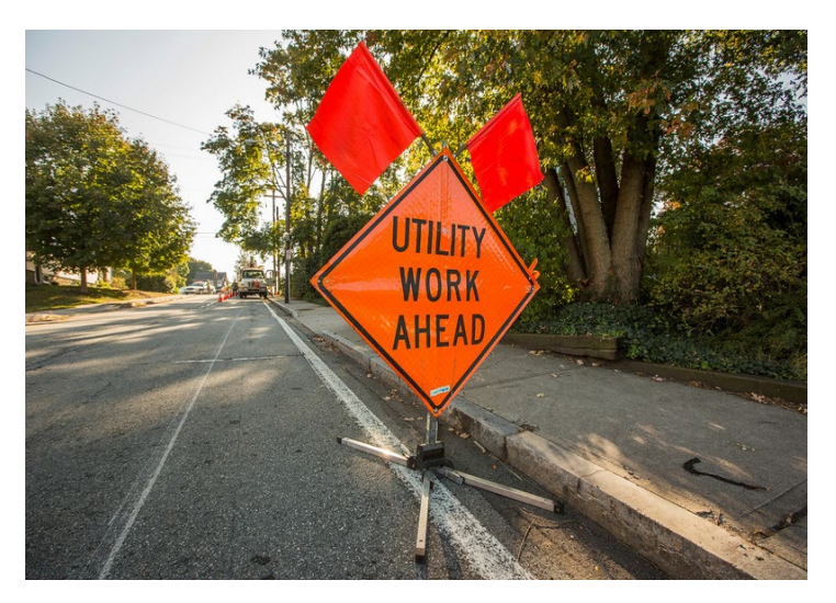
Benefits for you and your community: These initiatives will deliver improved reliability and resilience, new jobs and investments, and they support the goals of New York's Climate Act.